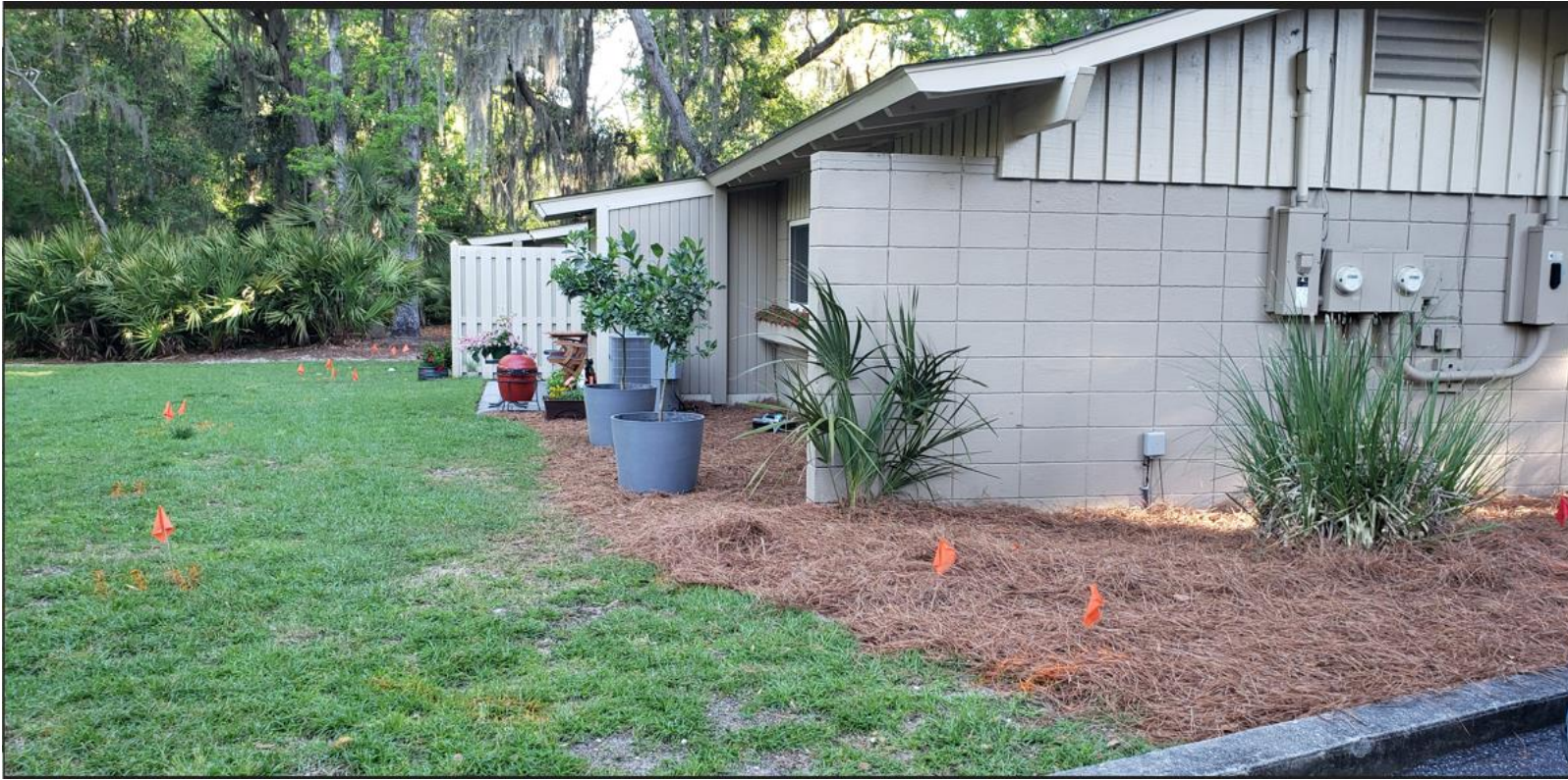
Pull Box for Fiber at end of J Building (J2), and Hargray Fiber entrance for J2.