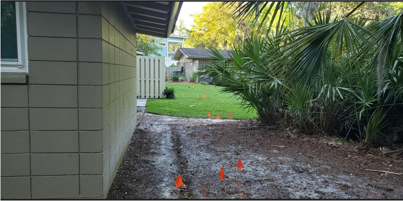
Continued path of Fiber to the endpoint pull box at the end of J Building (J2).