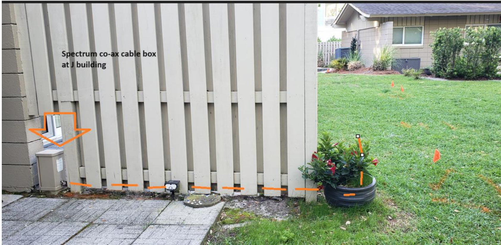
Spectrum coax cable runs to end of J building and into the common crawl space via the air flow opening, then is pulled to J1.